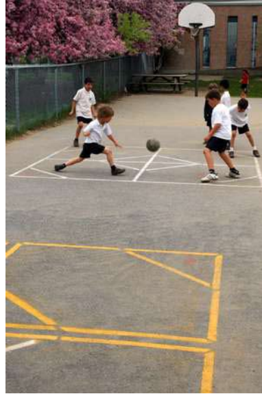
New - stenciled games, more to come by Improvement Committee