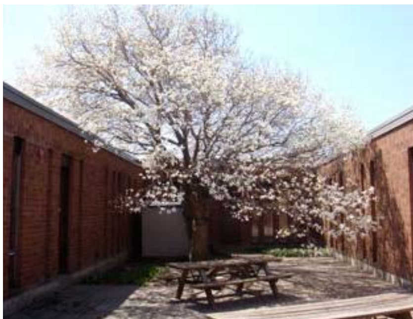
Magnolia tree in Westboro's courtyard